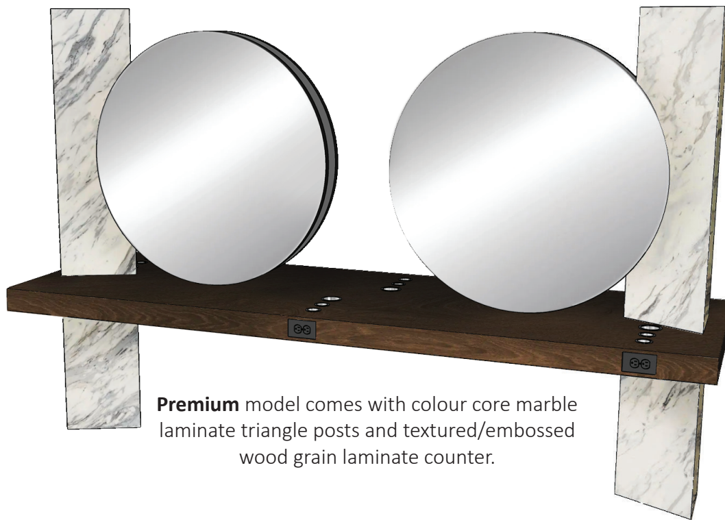
Premium model comes with colour core marble laminate triangle posts and textured/embossed wood grain laminate counter.

Geo Island Salon Station available in three styles. This 4 in one station will save you space and money. Each unit includes 4 stations in one unit. Station is bolted to the floor. Each station is equipped with a mirror, blow dryer holder, 2" hot tool holder, 1 1/2" hot tool holder and cut out for duplex right on the front of the countertop for convenience. Electrical can be hidden in the triangle posts coming from the floor or ceiling.